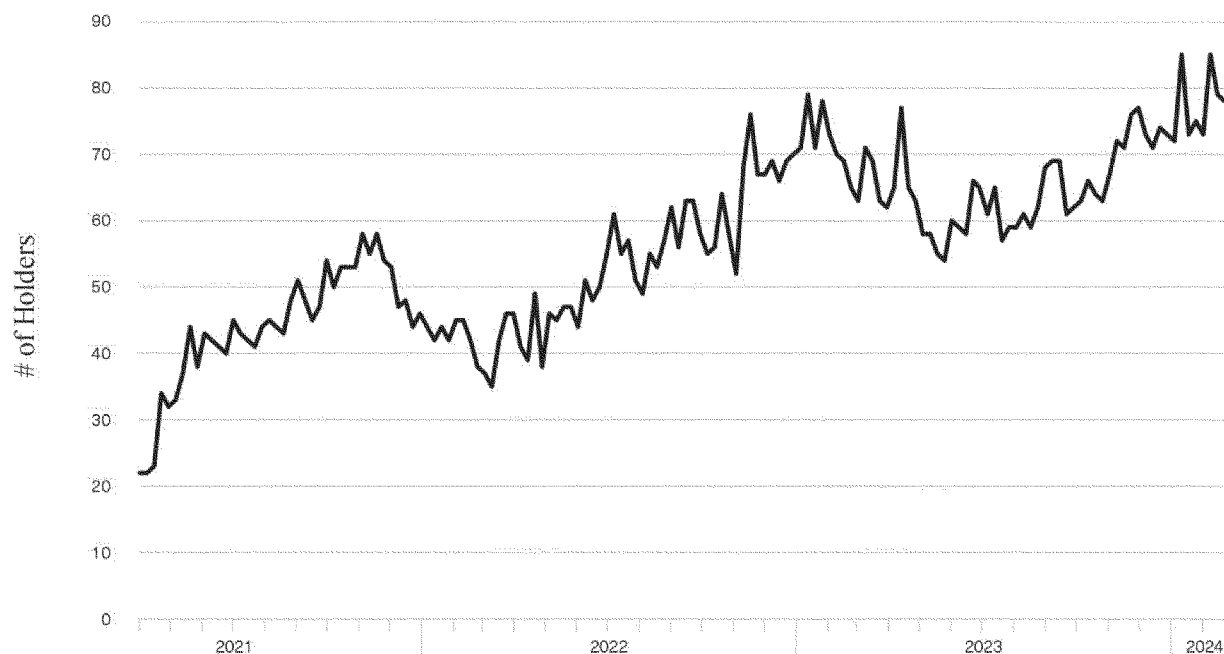
CME Ether Futures Large Open Interest Holders (LOIH)

The Commodity Futures Trading Commission (“CFTC”) regulates the CME ether futures market, and both the Exchange and CME are members of the Intermarket Surveillance Group (“ISG”). 21