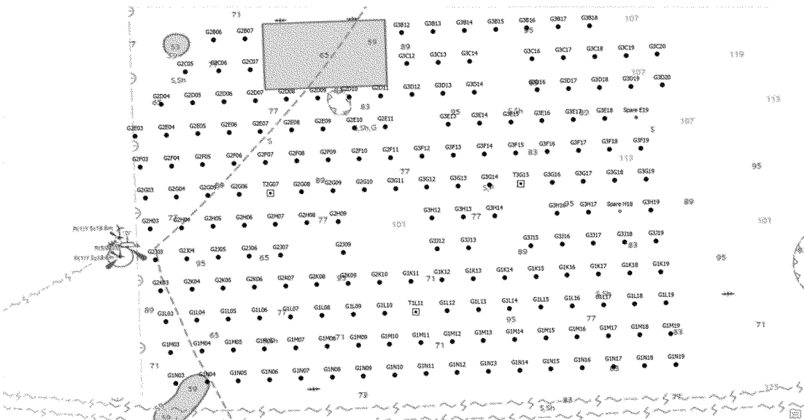
(Large scale chartlet showing the positions of the proposed safety zones with alphanumeric naming convention.)