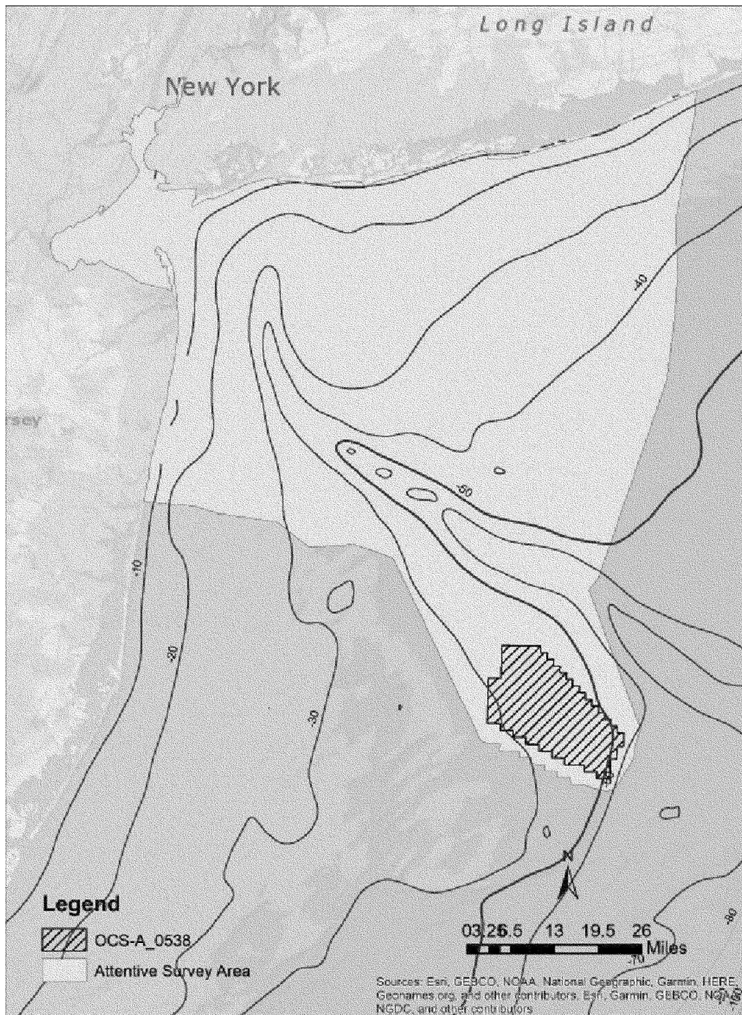
Figure 2 -- Survey Area with Bathymetric Contours Showing Water Depth