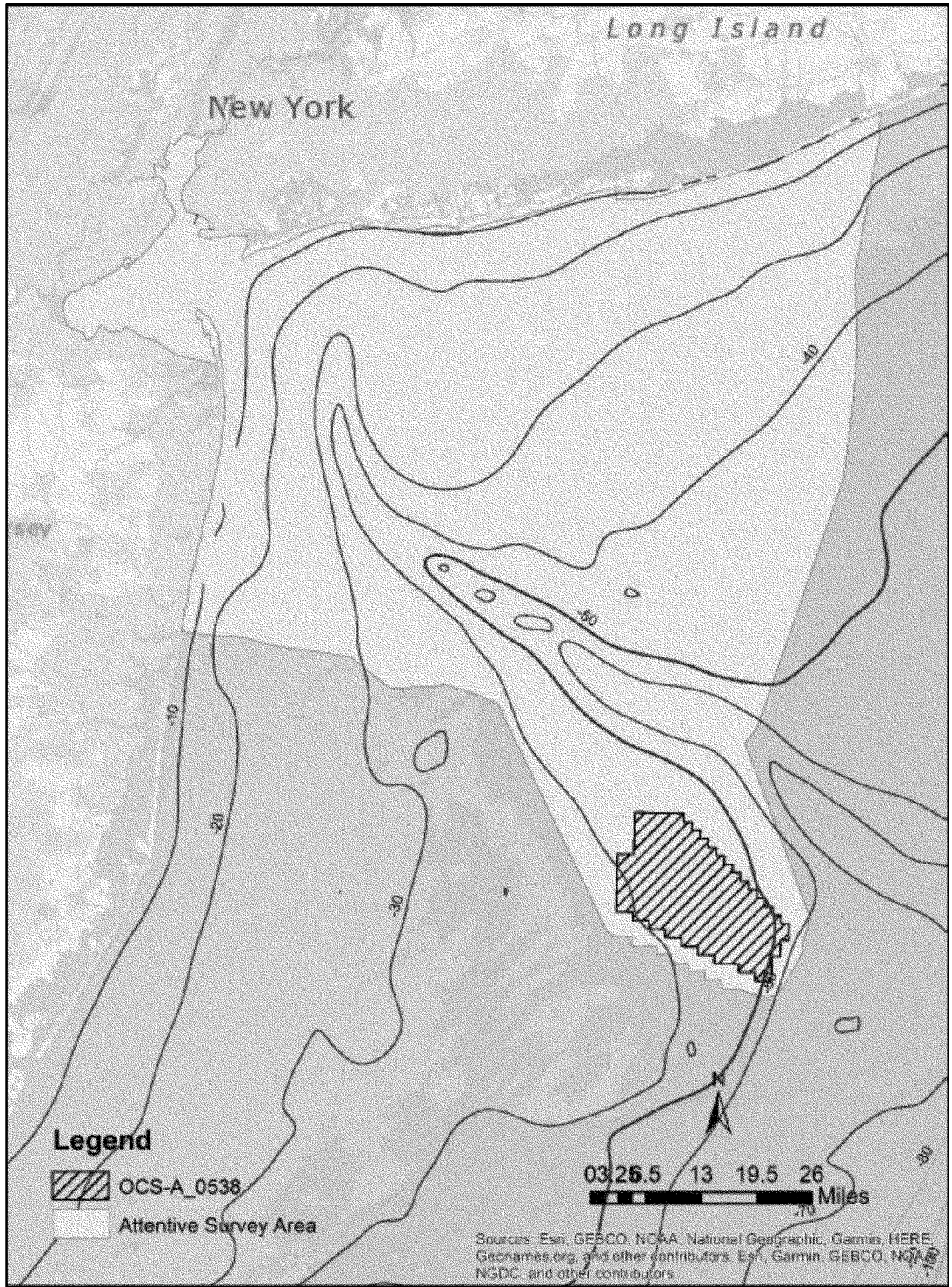
Figure 2 -- Proposed Survey Area with Bathymetric Contours Showing Water Depth