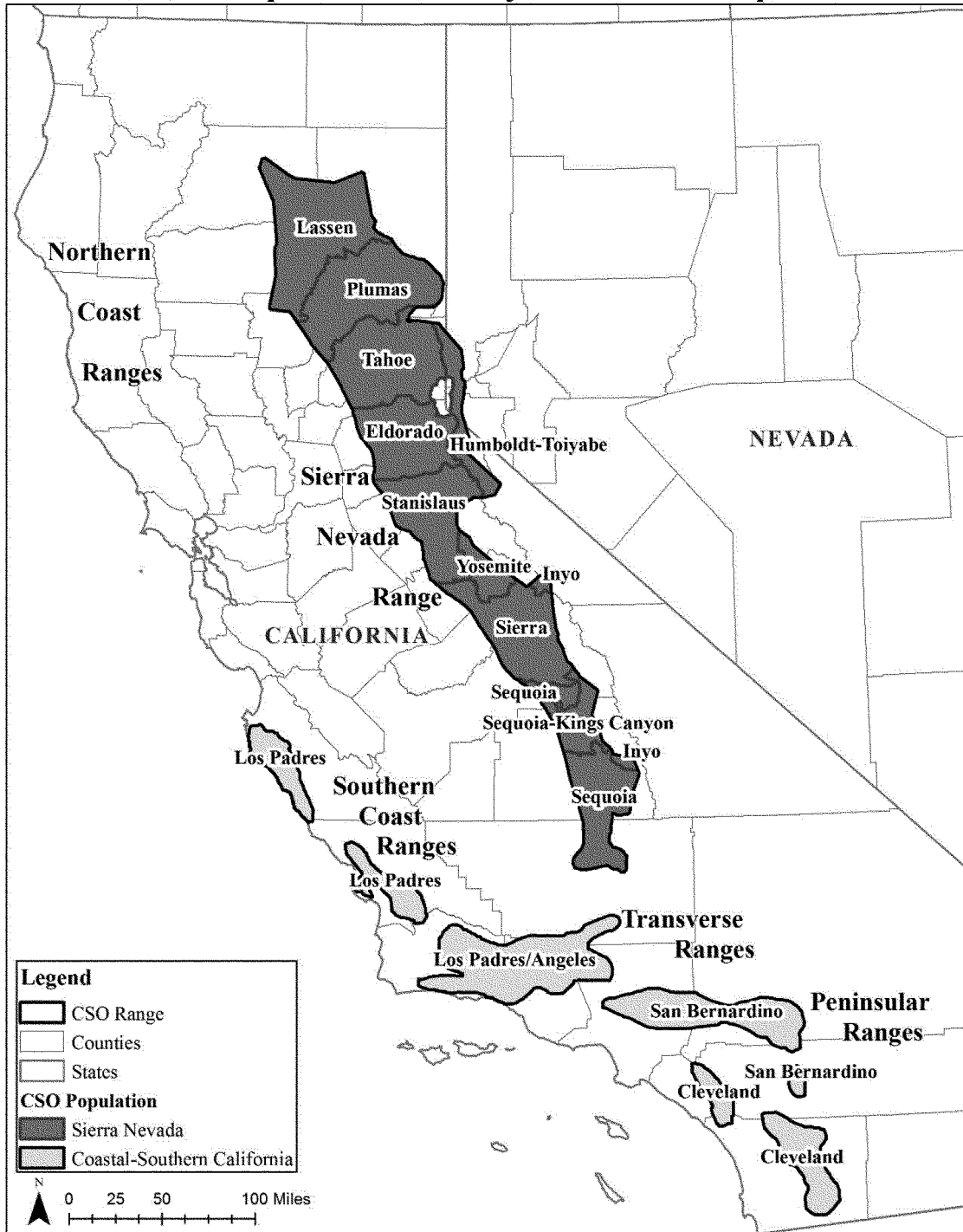
Figure 1—Populations and Analysis Units of the California Spotted Owl (CSO)