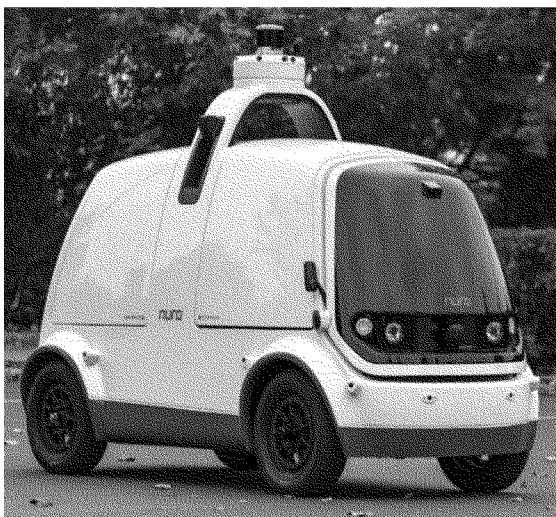
Figure 1: Photograph of Production R1