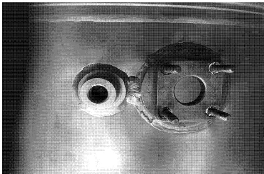
Figure 2 to Paragraph (h) of this AD. Combustion Chamber Case Assembly with One-Piece Bleed Pad with P3 Boss