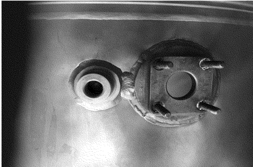
Figure 2 to Paragraph (g) of this AD. Combustion Chamber Case Assembly with One-Piece Bleed Pad with P3 Boss