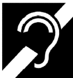
Figure 703.7.2.4 – International Symbol of Access for Hearing Loss