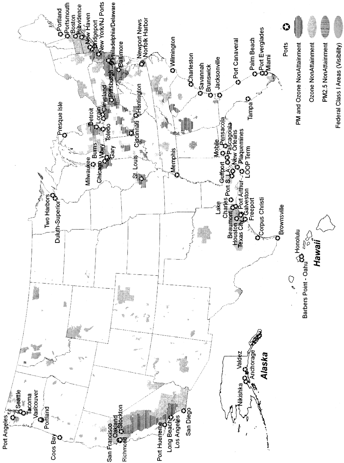
Figure II-1 Air Quality Problems are Widespread Especially in U.S. Port Areas