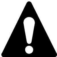
Figure 3 Carbon monoxide poisoning hazard label for package