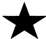
Figure 4 to Sec. 575.301 Sample Safety Concern Graphic for Sec. 575.301